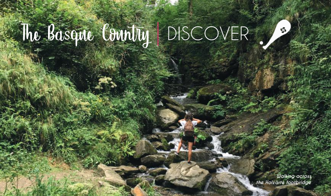
Walking across the Holzaré footbridge